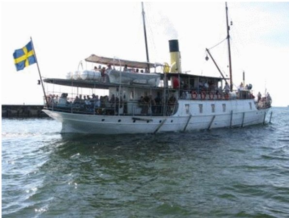
Steamship Trafik, Hjo

NAV will not, and cannot, pursue individual member's issues but we have a well established network in VGR where we can mediate contacts and support networking and different interests within the region.