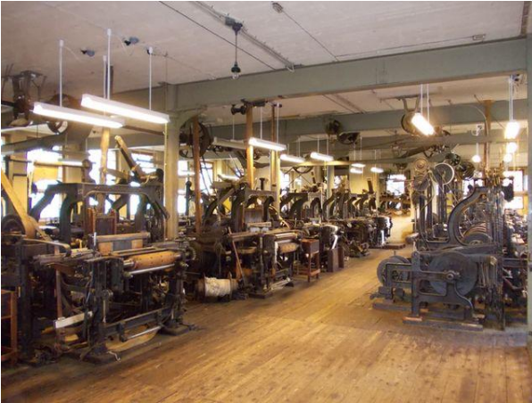
Gothenburg Belting Works (Remfabriken i Göteborg)

Visit our website www.navivast.se . Here you can find further information on our association, our members, and the different activities we arrange.